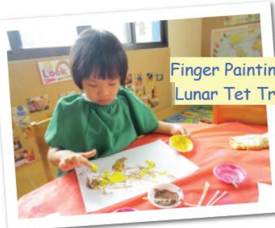
Finger Painting a Lunar Tet Tree

Kiddies groups in all Smartkids locations joined together to watch the Lion and Dragon Dance. We all enjoyed the performance and it was also nice to see all the children from each locations. After watching, we explored the outdoor area of Smartkids Tran Ngoc Dien.