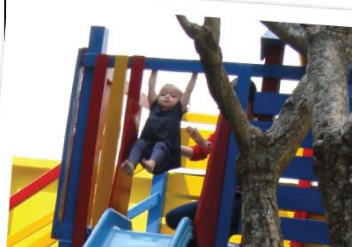
Vienna was surprised that she was able to swing on the bar!