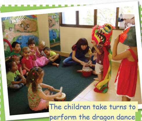
The children take turns to perform the dragon dance

What are Obstacle Courses for children's learning? - IT IS MORE THAN JUST PLAY!