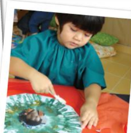
Making Christmas wreaths with our handprints and some gold glitters