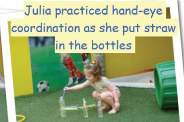
Julia practiced hand-eye coordination as she put straw in the bottles