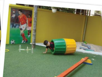
Tiberius crawled forward though the tube