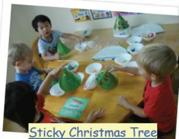
Sticky Christmas Tree Sticking different textures on the contact paper