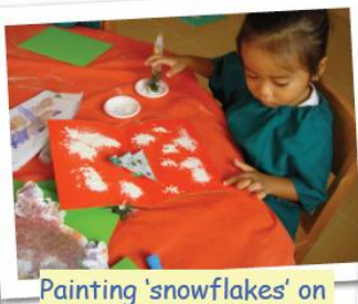
Painting 'snowflakes' on the christmas card for mommy and daddy