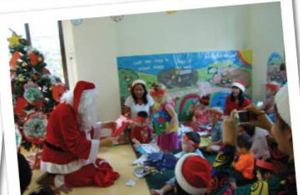
The group gave Santa a Thank You card and to wish him a Merry Christmas!